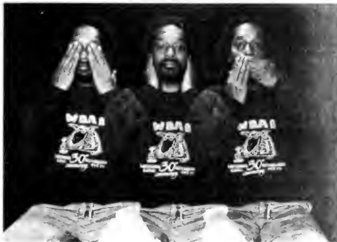
Our new Arts Director in but three of his many positions